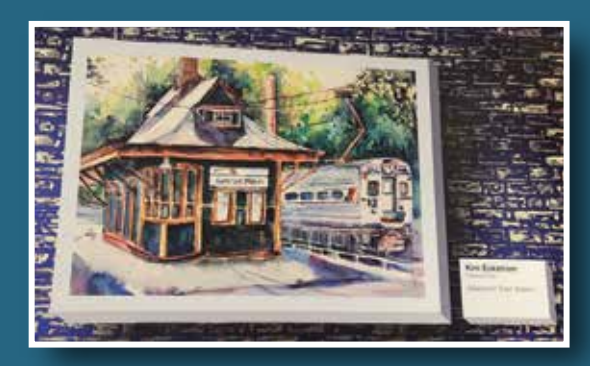
P&G at the airport. at Newark-Liberty Airport's new Terminal A. It depicts the historic Gladstone train station. The painting is part of a gallery of art that the Port Authority installed in the new terminal. The artist is Kim Eckstrom of Fanwood, NJ