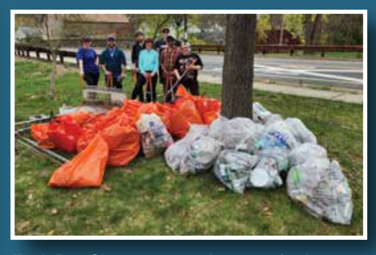
Earth Day Cleanup, 2023. A group of volunteers from both our town and other New Jerseyians display the large volume of trash collected during Stream Cleanup